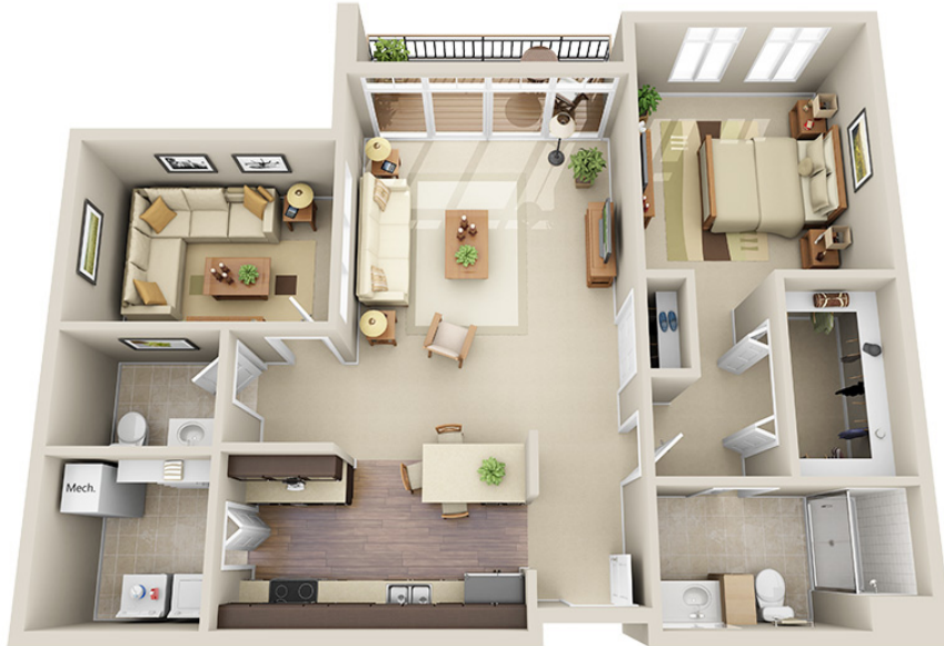
The Elmdale Residence | Unit 1E | Buildings B and C 1,157 Square Feet | 1 Bedroom.1.5 Bath.Den Architectural Plan next page >

Mandel Group's policy of improvement in construction and design requires that all specifications, equipment, dimensions, floorplans, and prices remain subject to change without notice. Square footages and dimensions shown are approximate. These images may include upgrades and other nonstandard options. The floorplans shown are solely intended to illustrate room and suggested furniture layouts.