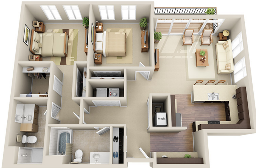
The Blackthorne Residence | Unit 2B | Building C 1,248 Square Feet | 2 Bedroom.2 Bath.Kitchen Pantry Architectural Plan next page >

Mandel Group's policy of improvement in construction and design requires that all specifications, equipment, dimensions, floorplans, and prices remain subject to change without notice. Square footages and dimensions shown are approximate. These images may include upgrades and other nonstandard options. The floorplans shown are solely intended to illustrate room and suggested furniture layouts.