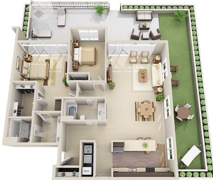
The Farwell Residence | Unit 2F Building A 1,577 Square Feet | 2 Bedroom. 2 Bath. Terrace Architectural Plan next page >

Mandel Group's policy of improvement in construction and design requires that all specifications, equipment, dimensions, floorplans, and prices remain subject to change without notice. Square footages and dimensions shown are approximate. These images may include upgrades and other nonstandard options. The floorplans shown are solely intended to illustrate room and suggested furniture layouts.