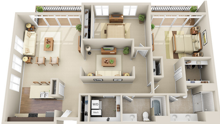
The Jarvis Residence | Unit 2J | Buildings B and C 1,492 Square Feet | 2 Bedroom.2 Bath.Kitchen.Pantry.Den/Media Room Architectural Plan next page >

Mandel Group's policy of improvement in construction and design requires that all specifications, equipment, dimensions, floorplans, and prices remain subject to change without notice. Square footages and dimensions shown are approximate. These images may include upgrades and other nonstandard options. The floorplans shown are solely intended to illustrate room and suggested furniture layouts.