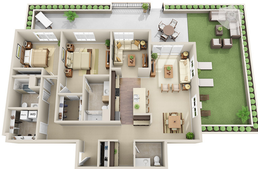
The Kent Residence | Unit 2K | Building A 1,627 Square Feet | 2 Bedroom.2.5 Bath.Den/Media Room.Terrace Architectural Plan next page >

Mandel Group's policy of improvement in construction and design requires that all specifications, equipment, dimensions, floorplans, and prices remain subject to change without notice. Square footages and dimensions shown are approximate. These images may include upgrades and other nonstandard options. The floorplans shown are solely intended to illustrate room and suggested furniture layouts.