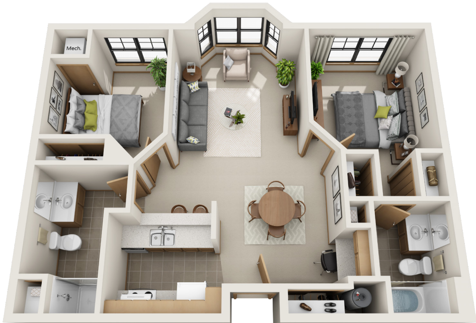
LIBRARY HILL APARTMENT HOMES THE HEMINGWAY | 2 BEDROOM 2 BATH | 990 SQ FT