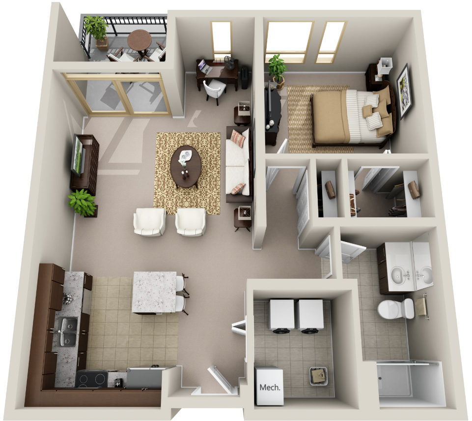
unit1C 773 sq ft 1bedroom 1bath

Mandel Group's policy of improvement in construction and design requires that all specifications, equipment, dimensions, floorplans and prices remain subject to change without notice. Square footages are approximate. These images may include upgrades and other non-standard options. The floorplans shown are solely intended to illustrate room and suggested furniture lay-outs.