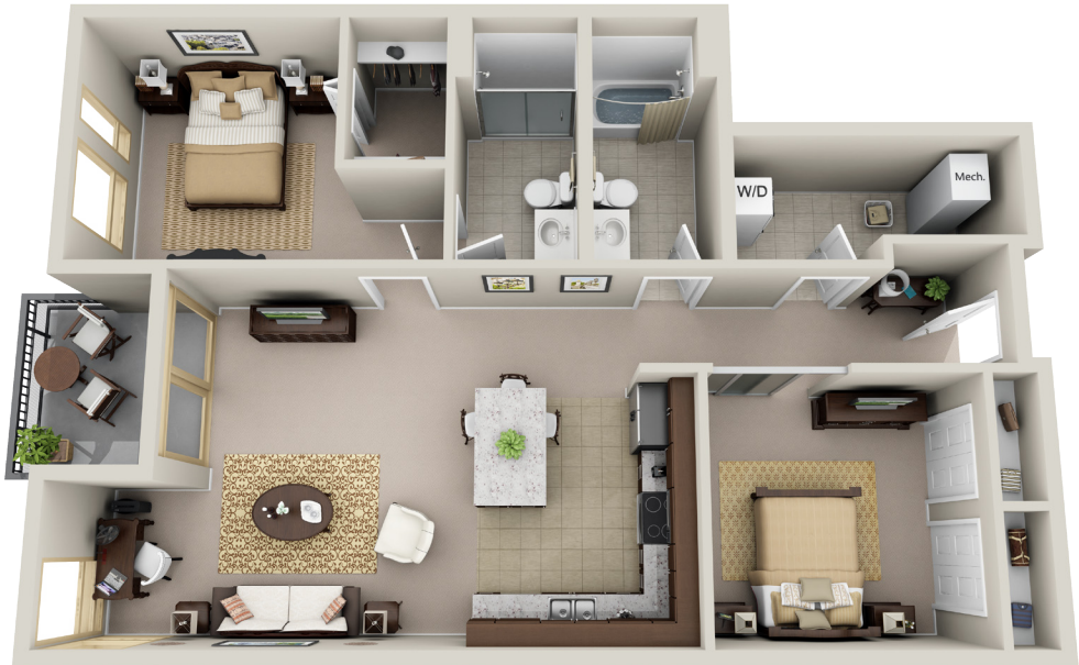
unit2A 1,089 sq ft 2bedroom 2bath

Mandel Group's policy of improvement in construction and design requires that all specifications, equipment, dimensions, floorplans and prices remain subject to change without notice. Square footages are approximate. These images may include upgrades and other non-standard options. The floorplans shown are solely intended to illustrate room and suggested furniture lay-outs.