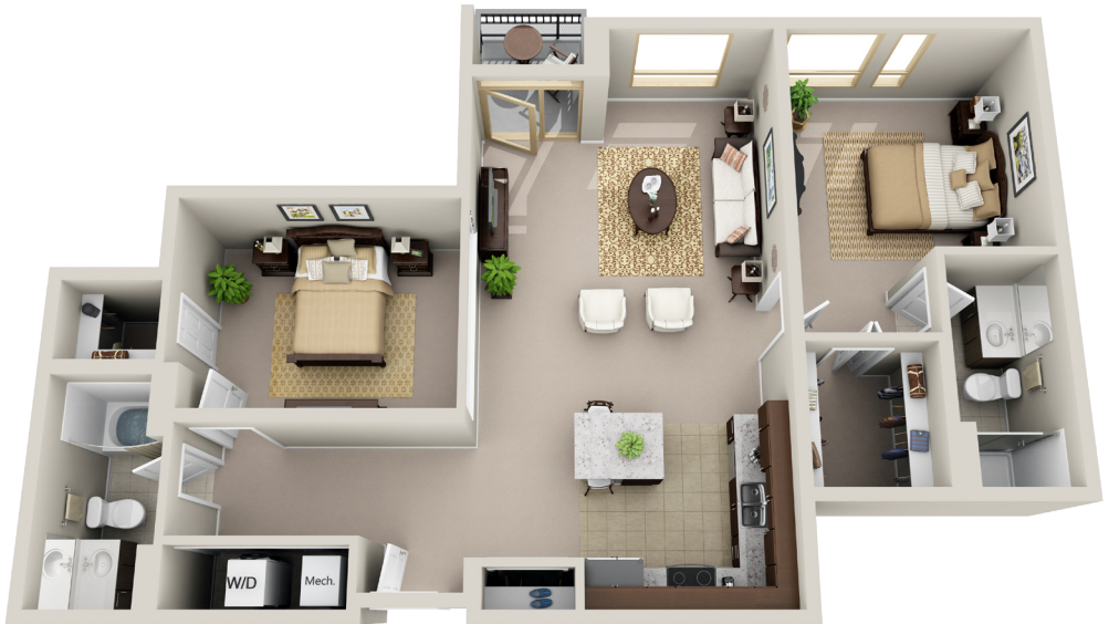
unit2B 1,111 sq ft 2bedroom 2bath

Mandel Group's policy of improvement in construction and design requires that all specifications, equipment, dimensions, floorplans and prices remain subject to change without notice. Square footages are approximate. These images may include upgrades and other non-standard options. The floorplans shown are solely intended to illustrate room and suggested furniture lay-outs.